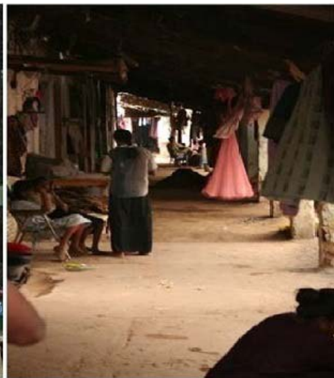
Eelam Tamils refugees camp at Thalaiyuthu, Tirunelveli (Tamilnadu)