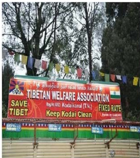
Association banner in front of Tibetan refugees camp at Kodaikanal (Tamilnadu)

Indian government guaranteed the right in equality to all citizens of India. Nevertheless, it has not treated all country's refugees equally, the government has ensured maximum rights to the Tibetan refugees and they permitted to get jobs in public services. The Eelam Tamil refugees receive the worst treatment from Indian Government in the refugee's category. They are almost ignored by the states compared to other refugees. They frequently experienced all forms of discrimination in all areas like governmental, non-governmental and private sectors including educational institutions and hospitals. Complete repression is imposed on the camp people regarding to express their feelings and defects by demands, protests and speeches in public places. Many Eelam Tamils attempted to give minimal contribution for the recent pro students uprising for the liberation of Tamil Eelam agenda in Tamilnadu. They requested the nearest police stations to conduct one-day demonstration for assisting student's voice; the state refused the request in many places. During the data collection, many Eelam Tamils expressed their anguish for their inability to give voice for their own