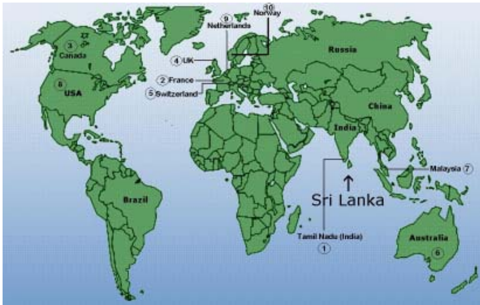
Figure 1 : Closed Top ten countries are having Eelam Tamils under the refugee status.

proved by the large-scale arrival of Eelam Tamils to Tamilnadu. Even, economic factors similarly decided the asylum in various places of the world; rich Eelam Tamils moved to distant countries and poor Tamils selected Tamilnadu. Many Tamil literatures proved Eelam and Sri Lanka once upon a time was integrated with Tamilnadu under the Lemuria Kandam or Kumari Kandam. 3 Therefore, the geographical factors also assisted to claim support from Tamilnadu for the Eelam Tamils, hence, the Eelam Tamils vastly obtained asylum in Tamilnadu and they feel this asylum will be sophisticated to strengthen Tamil Diaspora.