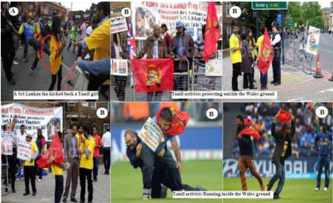
Figure 3 : Eelam Tamil girl kicked by a Sri Lanka fan (A) and the protests by the Tamil activists at oval and Wales grounds (B).

www.IndianJournals.com Members Copy, Not for Commercial Sale Downloaded From IP - 210.212.129.125 on dated 11-Apr-2016