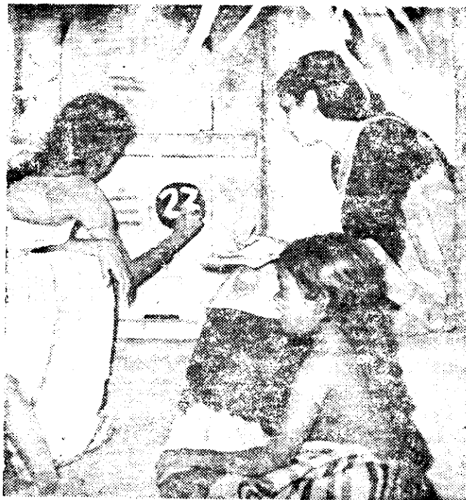
Sociology students of Stella Maris College painting door number on a hut in Inchambakkam village for the research-cum-action project of Lions Club, Madras East.