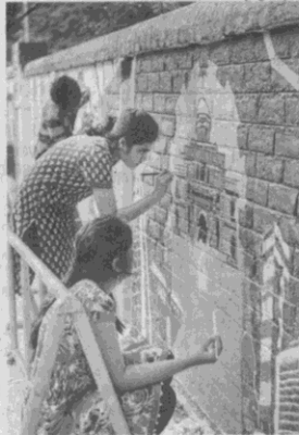
Above and right: students of Anna University paint the walls

According to the students, the paintings depict the biodiversity within