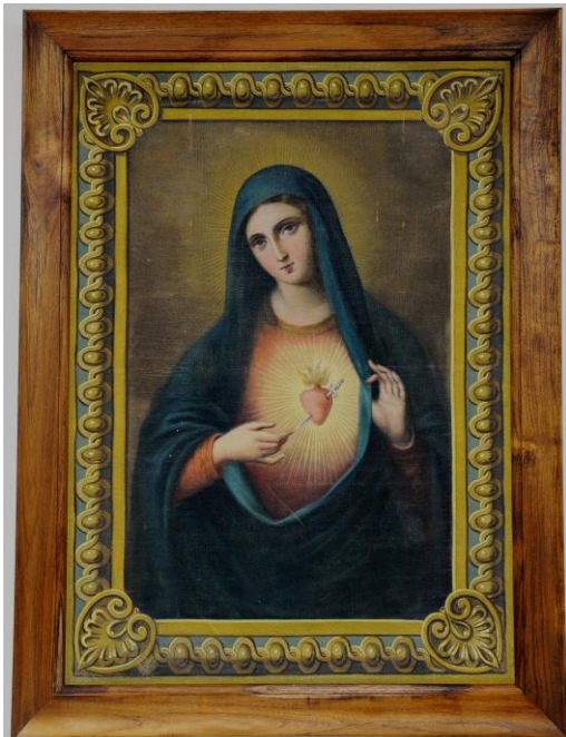
Immaculate Heart of Blessed Virgin Mary

Her painting of the Immaculate Heart of Blessed Virgin Mary, that adorns the Stellarchives presently, retains its glow to this day. Her skill in calligraphy was known to those to whom she wrote. Even lengthy letters retained an overall sense of design and harmony. Her inner person was harmonious and she possessed a kind of heightened piety. Her warm humanity was particularly evident in a truly Franciscan love of animals. She would go without food herself rather than see animals starve.