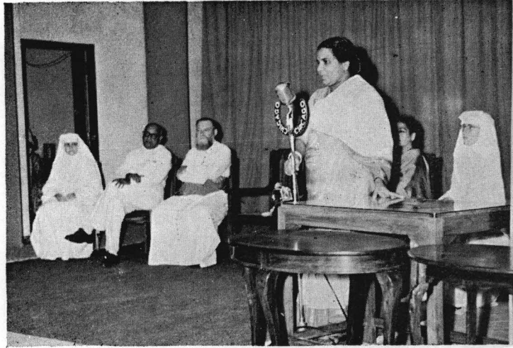
Presidential address of the Honourable Minister Mrs. Lourdammal Simon