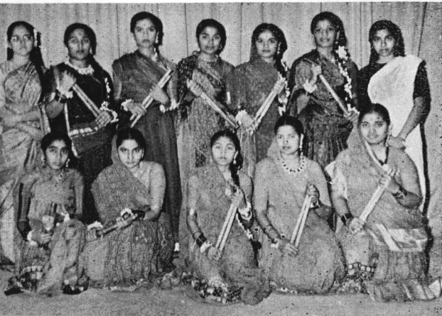
Gujerati Folk Dancers