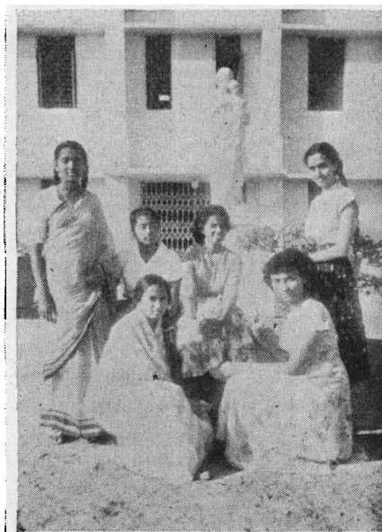
Before the Hostel

The horizon is not, however, entirely cloudless. A large debt on the College buildings still remains outstanding. But we have an unshaken confidence in God's paternal Providence, as also in the continued assistance of our kind benefactors and truly loyal students whose efforts in this direction have never flagged throughout the year. Their cheerful and enthusiastic generosity is indeed a consolation to us.