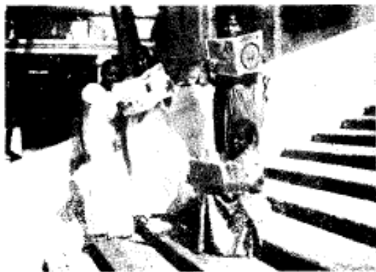
The Spectator and Punch are Geographical Favorites among these literary-minded young women.