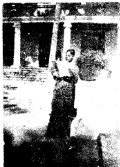
The Geographic Magazine from America is the delight of every student.