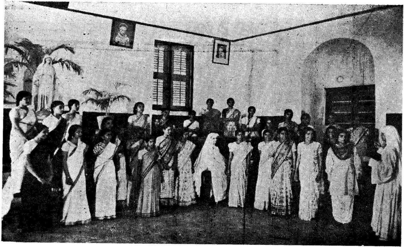
“ We Students Gather Here ”