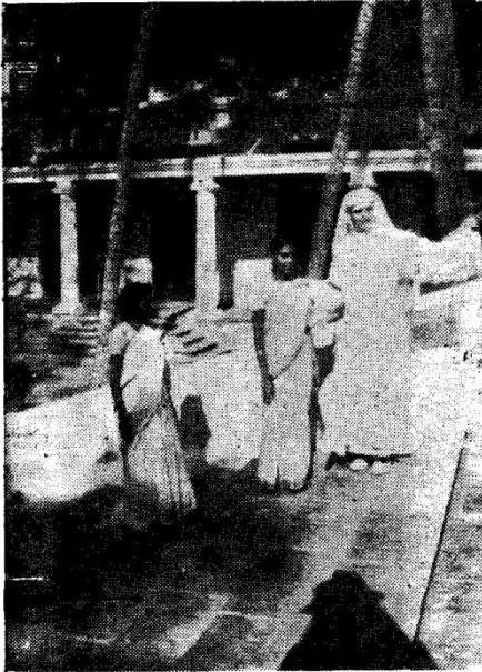
Confidently the students approached the Sisters.

Onerous were the problems that confronted the Administration. Adequate buildings had to be selected, University requirements had to be satisfied and Public Education regulations to be complied with—all within the space of a few weeks.