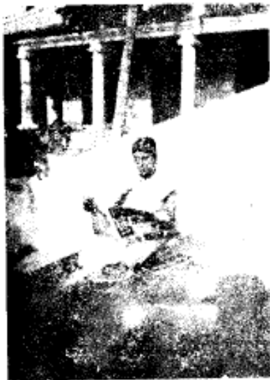
Absorbed in the latest arrivals from London.