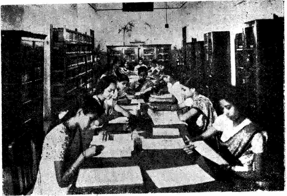
In the Library.

An abundance of current literature has been arriving, donated by friends from abroad.