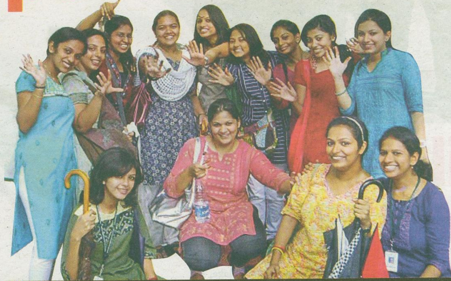
GIRL POWER: The organisers of Minsar

schools and colleges. We are also looking to sign up with electrical manufacturers to help our cause."