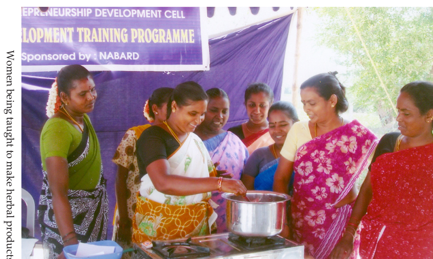
Women being taught to make herbal products