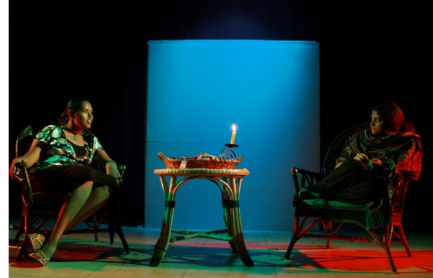
A scene from the College play

humorous opening monologue, ‘Mayadevi’s London Yatra’, the psychological thriller, ‘Tempest in Autumn’, Ambai’s ‘A Movement, a Folder and Some Tears’ that made for effective drama to Amtul Rahman Khatun’s ‘Grandmother’s Tale’ that was an attempt at dramatizing a story consistently using the ironic mode, the play combined a multiplicity of genres. The long opening monologue, the flavour of Hindustani music, skilful performances by students and rich drama in snatches were the play’s strong points.