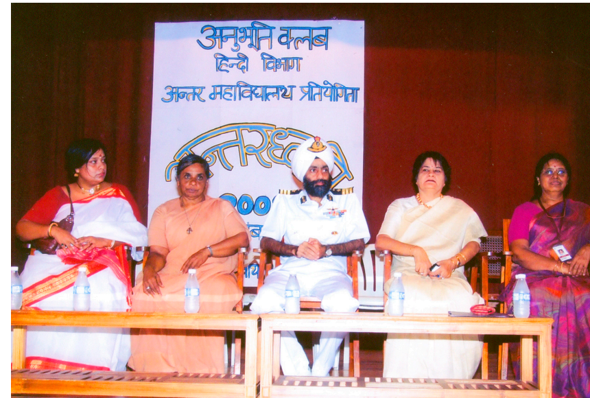
Department of Hindi – One day seminar on “Cultural Unity through Hindi Literature and Official Language,” August 2008