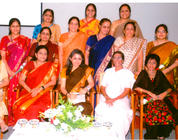
Alumnae Association Executive Committee

In keeping with the vision of the college to enable students who are socially and economically disadvantaged to pursue higher education, the college offers numerous scholarships and fee concessions. The Golden Jubilee Scholarships, with a principal amount of Rs.30,000 the Millenni-