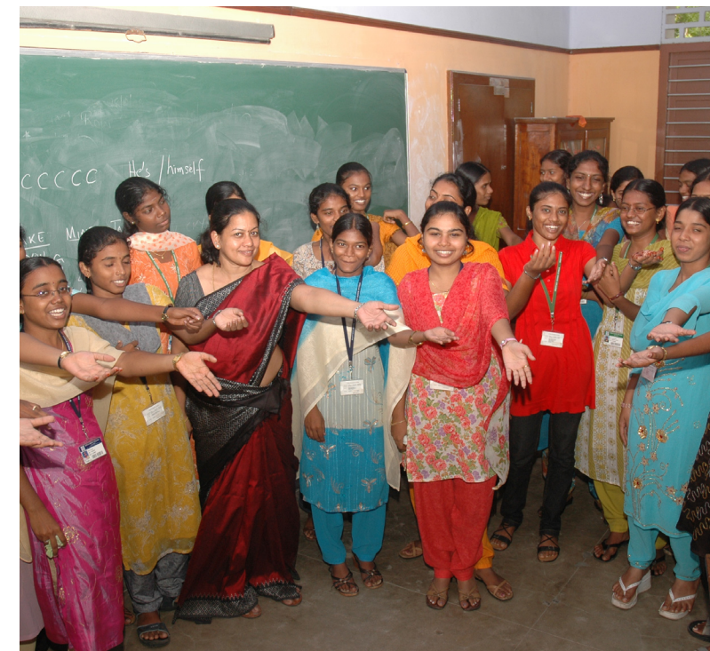
'Be a Leader' - FAEA Workshop

Foundation for Academic Excellence and Access, the FAEA Programme funded by the Ford Foundation is a collaborative effort which continues to empower students from disadvantaged sections of society by training them in Life skills, Soft Skills, Computer Applications, and Employability and Entrepreneurship skills by professional trainers throughout the year. Two new language practice software from the United Kingdom to practise Conversation and Business Writing have been recently installed in the FAEA-sponsored Multimedia Language Lab. More than 400 students of the college enthusiastically attend these workshops. The students are also given free access to browsing in the Internet Centre on campus.