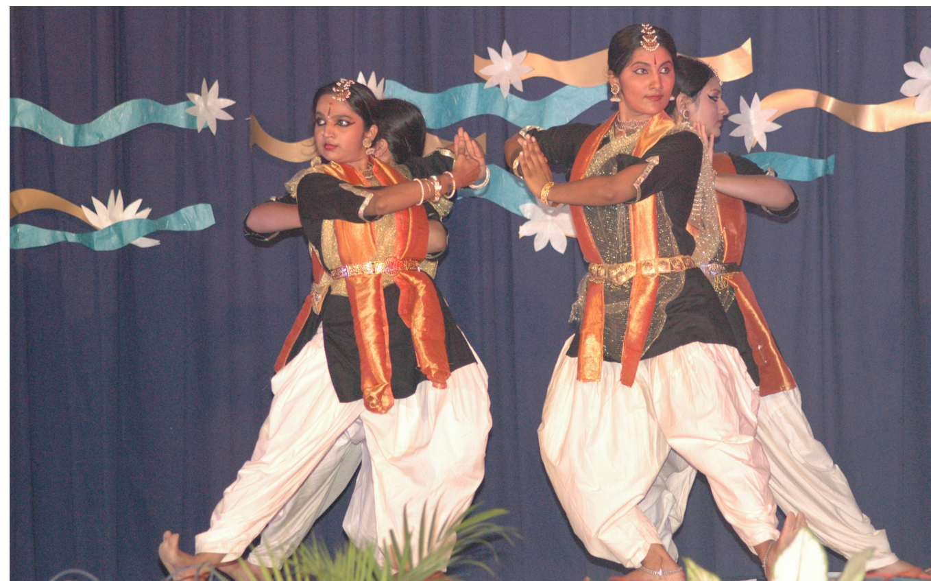
Dancers perform on College Day