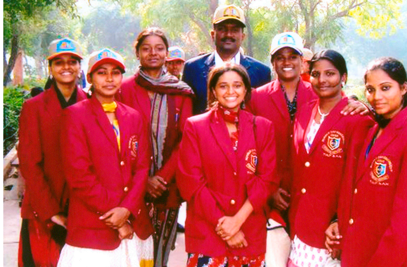
NCC Cadets in New Delhi

was celebrated in February 2009 in collaboration with the National Entrepreneurship Network. The students of the EDC participated in inter collegiate programmes and organized an 'Idea Generation' programme on campus which was attended by more than 100 participants bringing a sense of harmony.