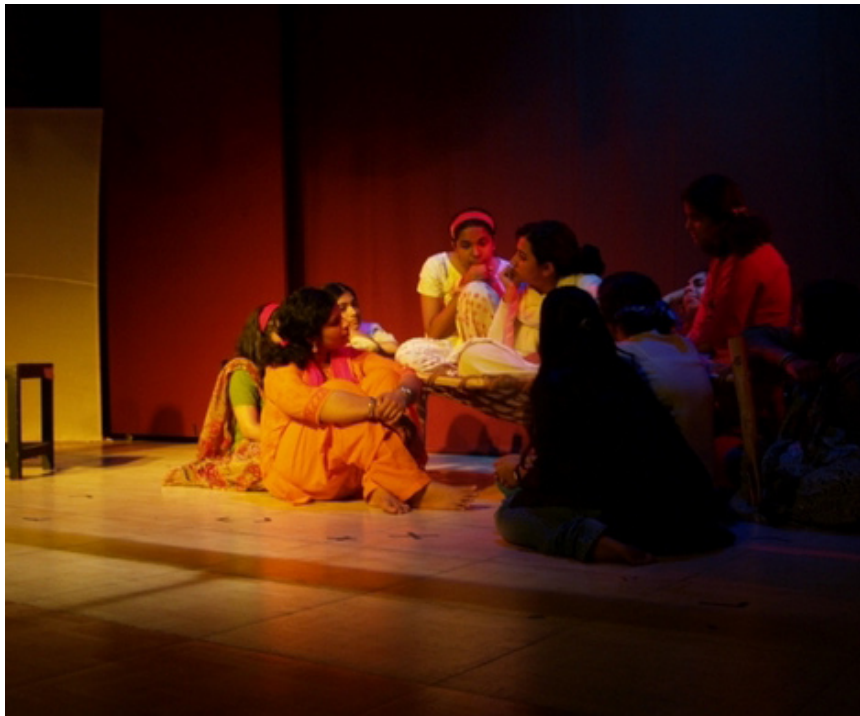
A scene from the College play

With no script, except for the slightly edited version of the original stories, the different narratives intersected in a dialogic relationship. From the