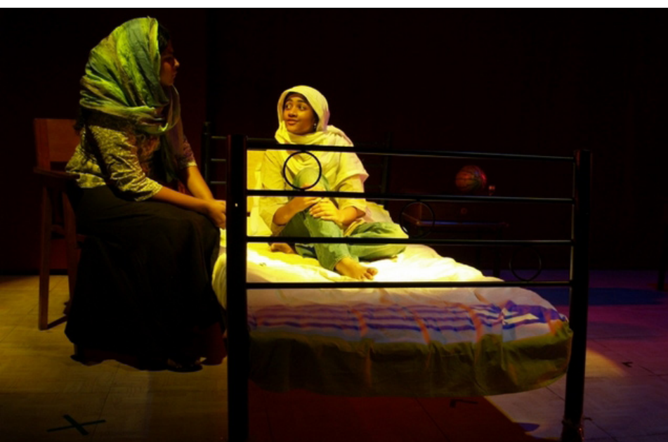
A scene from the College Play