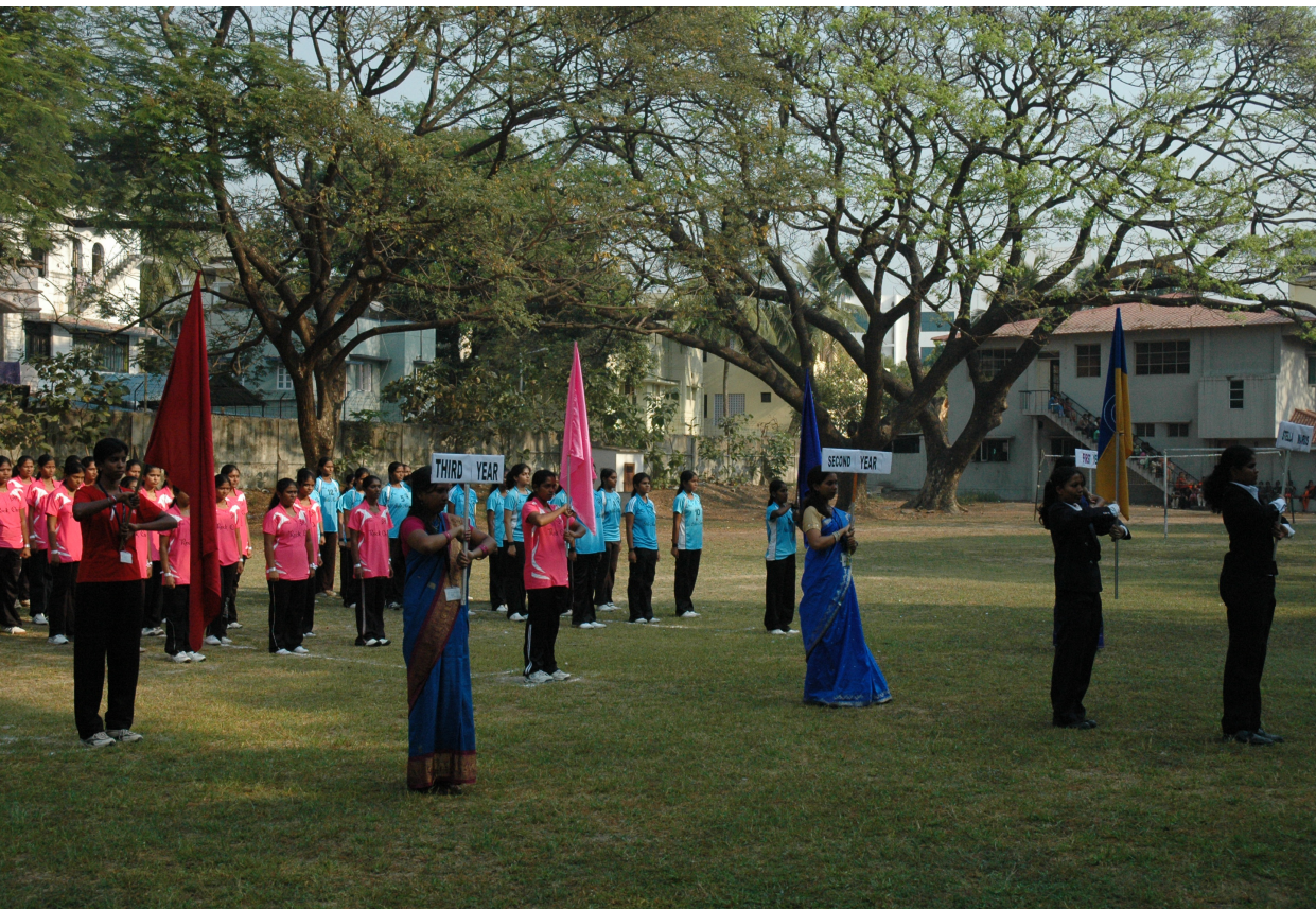
March past on Sports Day