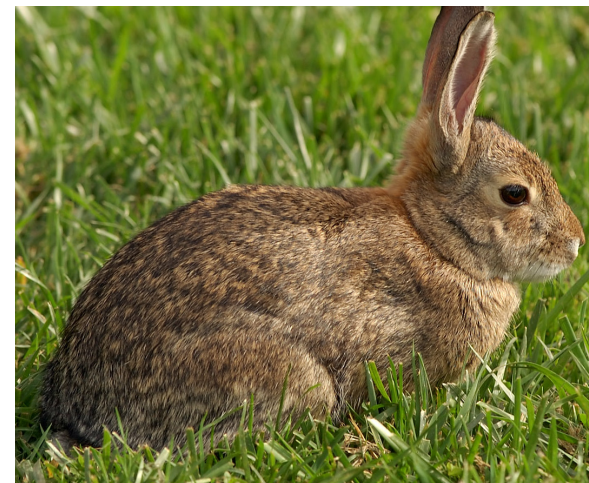
Oryctolagus Cuniculus a.k.a. Bunny

Sometime later we were transported to a strange place. My brothers and I had no clue as to where we were and I was bewildered to see strange creatures that I had never seen before. Some of them had limbs which could make them fly while some had limbs which could make them swim. One of the two legged creatures lifted our cage and put it on the glass counter. Now my brothers and I realized that we could never see our family again. My brothers had lost hope but I wouldn't give up. I was determined to find my family and my home. A week later two humans came to take my three brothers. I believe they were from a place called a restaurant. We were helpless and could do nothing. I had no idea what they were going to do to them. All I could do was hope and pray that they would be well. Two weeks passed and I lay alone in my cage. My so called master had given me a piece of rotten banana which I would occasionally nibble on.