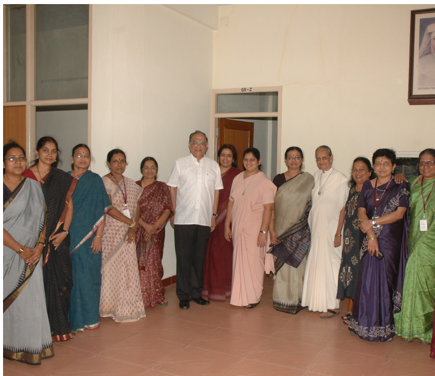
Kamala Aravind Endowment Lecture (Inter- national Studies Depart- ment 9-01-2009). Former Chief Election Commis- sioner of India T. S. Krishna Murthy delivered the lec- ture "The Challenges facing Indian Democracy"