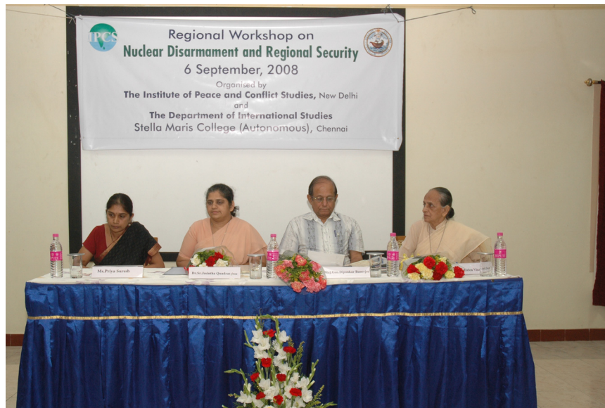
Department of International Studies – Regional Workshop for Young Researchers on “Nuclear Disarmament and Regional Security” in collaboration with the Institute of Peace and Conflict Studies, New Delhi held on 6 September, 2008