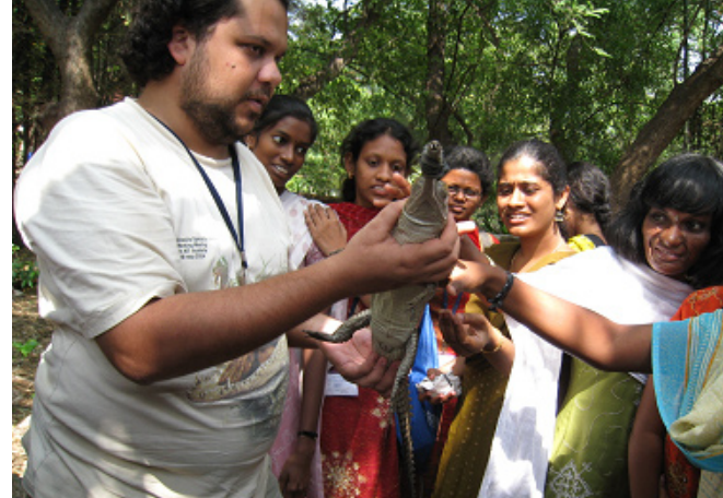
National Conference on 'Novel Polymeric Materials' Students at the Crocodile Bank as part of a workshop

programmes, were sponsored by the Tamil Nadu State Council for Higher Education and the Academic Staff College, University of Madras.