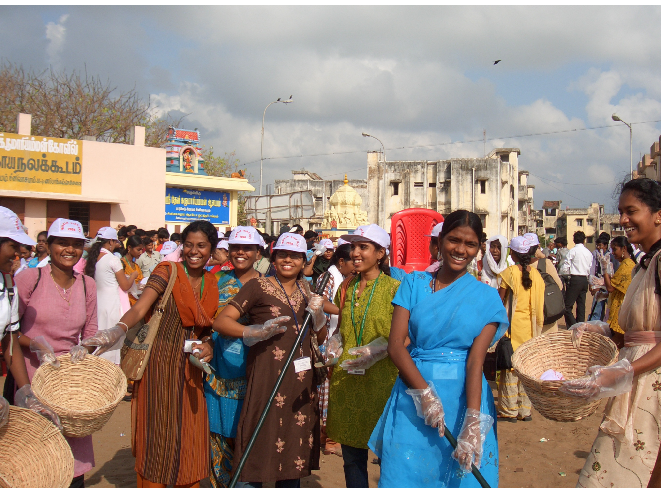
Students in action

ness campaigns in the cause of Adolescent Diabetics, Clean Marina, and Safety of Pedestrians. NSS was part of Independence Day celebration, Children's Day celebration, Conference on Entrepreneurship, HIV/AIDS Workshop, state level seminar on Human Rights, training on gender issues, youth leadership and Friends of Police. Students participated in a one week pilot training on gender equity and a workshop on youth and climate change for action organized by the Rajiv Gandhi National Institute of Youth Development. The NSS students assisted in the organization of elections for the Visually Challenged Association. NSS volunteers scribe on a regular basis for the visually challenged in Little Flower Convent, Lotus Blind and Good Will Foundation. They were involved in the programme organized by the Leo Club Handi Park to conduct various sports events for special children from Chennai city. The NSS also conducted a one day eye camp with professional and technical support extended by Uma Eye Clinic, Anna Nagar. 200 students and staff benefited through the programme.