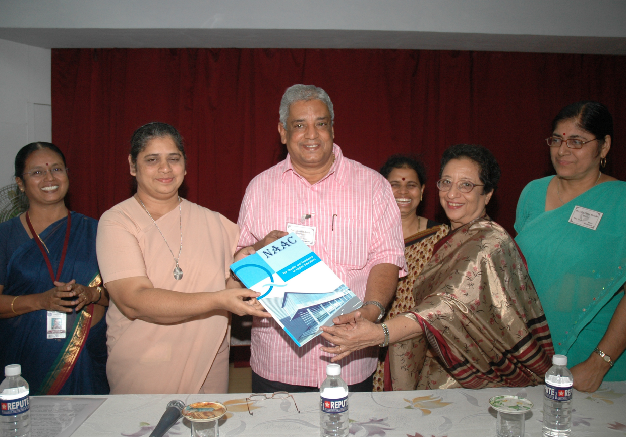
Reaccreditation of the college by the NAAC