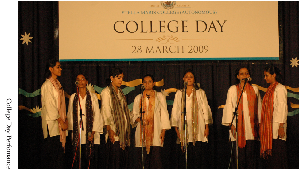
College Day Performance

the unique distinction of having received interview calls from all seven IIMs having scored a percentile of 99.95.