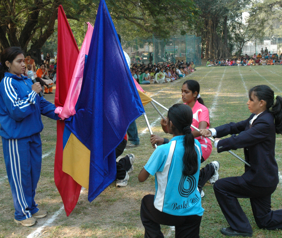
Oath taking Ceremony on Sports Day