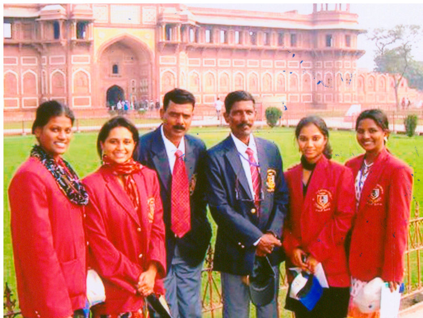
NCC Cadets in Delhi

The NCC with its visionary aim of empowering the youth of the nation has since inception inspired the cadets of Stella Maris College to put service before self and respond to every challenge with courage and conviction. This year too has been no different and cadets have worked hard all year and have won laurels for this great institution.