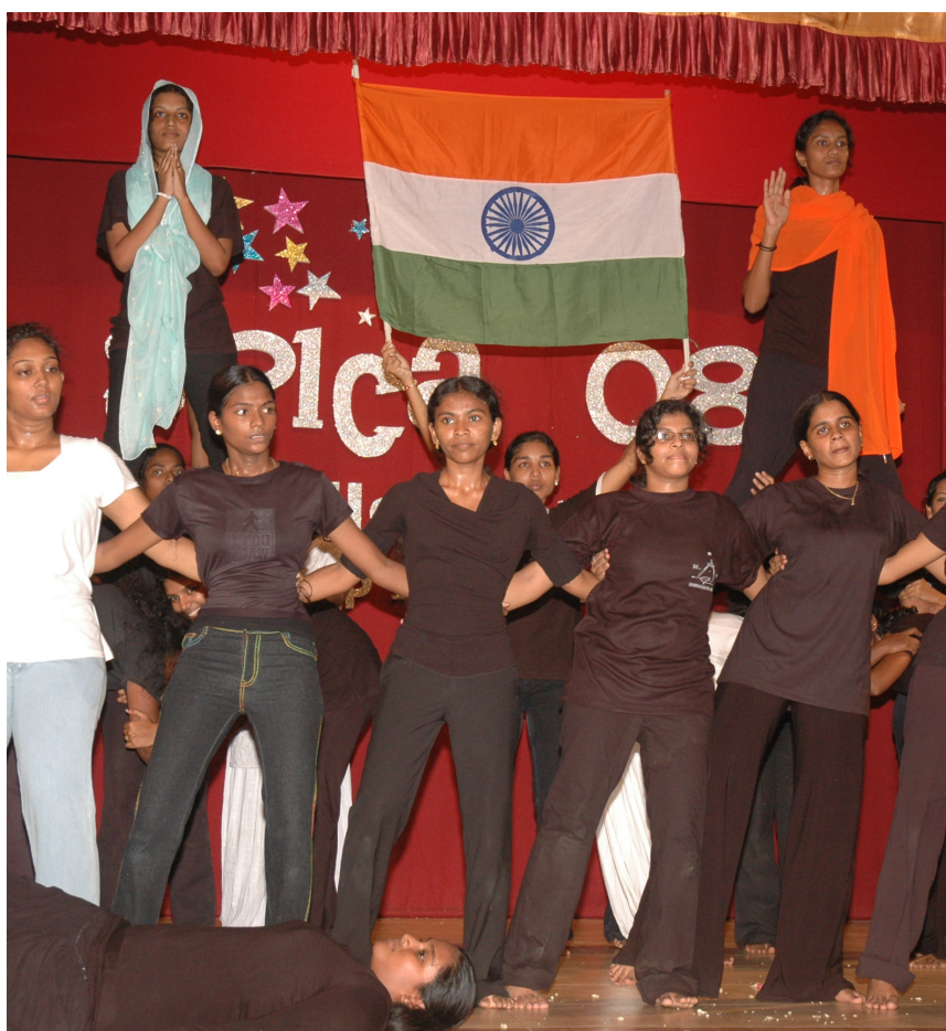
Host performance - Spica 2008