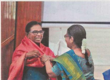
Snapshots of the event organised for retired faculty and alumni.

book project, says the book shown on the occasion was just a teaser, and the team is working on adding many more nuggets of history to its pages.